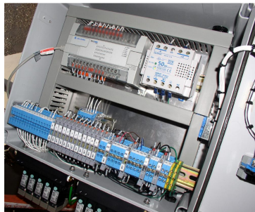
PROCESS LOGIC CONTROLLER