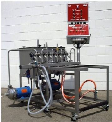
MINI KING (MK)

The Squire 'Plus 2', Mini King & Mini King 'Plus 2' machines, the standard within the worlds craft brewing industry. With more than 350 of these systems installed worldwide in Brewpubs, Micro-Breweries, Cideries and Wineries, they are the ideal system for 20 to 35 kegs per hour output.