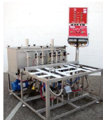
MINI KING 'PLUS 2' (MKP2)